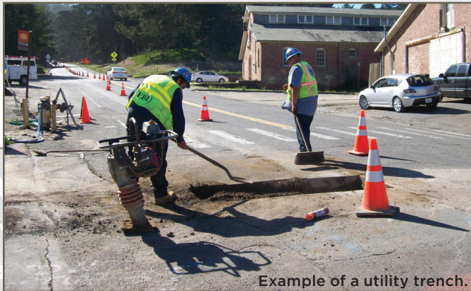
Example of a utility trench.

The construction effort will take approximately four years to complete. This ongoing series of advisories will update Presidio residents and employees about what to expect as work progresses at the park.