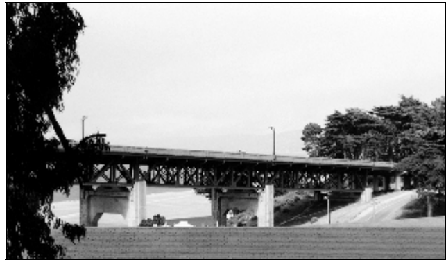
Doyle Drive viaduct structure

The purpose of the proposed project is to improve the seismic, structural, and traffic safety of Doyle Drive within the setting and context of the Presidio of San Francisco and its purpose as a National Park.