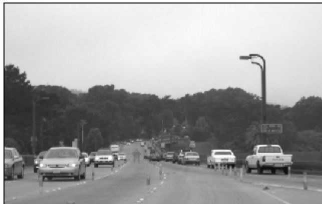
View of Doyle Drive looking west

The study also emphasized that the Doyle Drive replacement be designed as a parkway. Other important recommendations included building a transit center, and introducing transportation systems management and intelligent transportation systems technology, such as roadway surveillance cameras and real-time transit information kiosks.