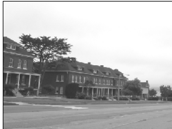
Historic structures within the Presidio

In 1991, Caltrans requested that the San Francisco Board of Supervisors revisit the most recent design concepts for Doyle Drive. The Supervisors responded with the establishment of the Doyle Drive Task Force, consisting of representatives from various local governments and public and private organizations. The Task Force considered design alternatives, developed a consensus on a preferred alternative, and in 1993 issued the Report of the Doyle Drive Task Force , which proposed a scenic parkway through the Presidio.